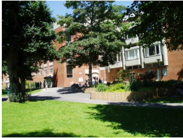
Left: Chichester Lecture Theatre and Chichester building entrance. Right: Bramber House.

inclusive, from 8am to 8.45am. On Saturday and Sunday morning breakfast is in IDS (the Institute for Development Studies), from 8.15am to 8.45am.