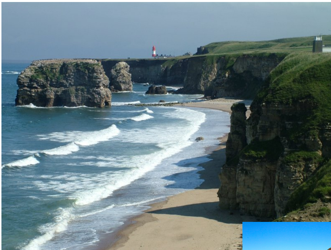
Pirate Cave at Marsden Bay South of South Shields roughly 45min by coach